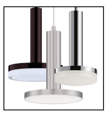
57600 PENDANT ACCESORY (Sold Separately, Fixture NOT included)