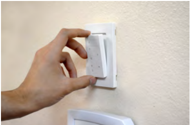
FCT6000WT Wall Control

Natural Rattan wicker forms a sloping drum shade with integrated fan and LED light source. The Dark Bronze finish of the metalwork encases an LED ring at the bottom directing light downward. Finished in outdoor coatings for the rattan and the metalwork, this Fandelight is designed for outdoor spaces as well under covered roofs. Add coastal flair and find some respite under the breeze flowing from an utter FanDelight by Maxim.