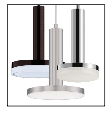
57600 PENDANT ACCESORY (Sold Separately, Fixture NOT included)