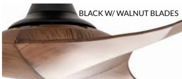
BLACK W/ WALNUT BLADES