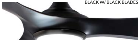
BLACK W/ BLACK BLADES